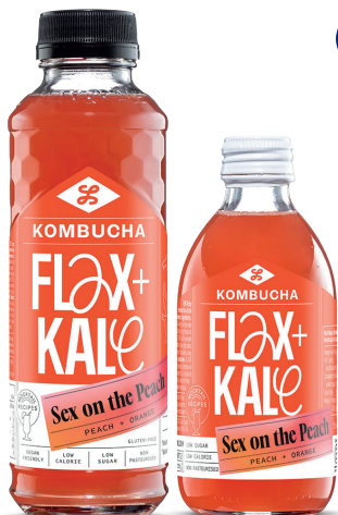
SEX ON THE PEACH

On the peach, on the beach, or wherever. Our mocktail version of the classic Sex on the beach cocktail can be enjoyed whenever, wherever, and however you like. Of course, its sweet taste will always leave you wanting more.